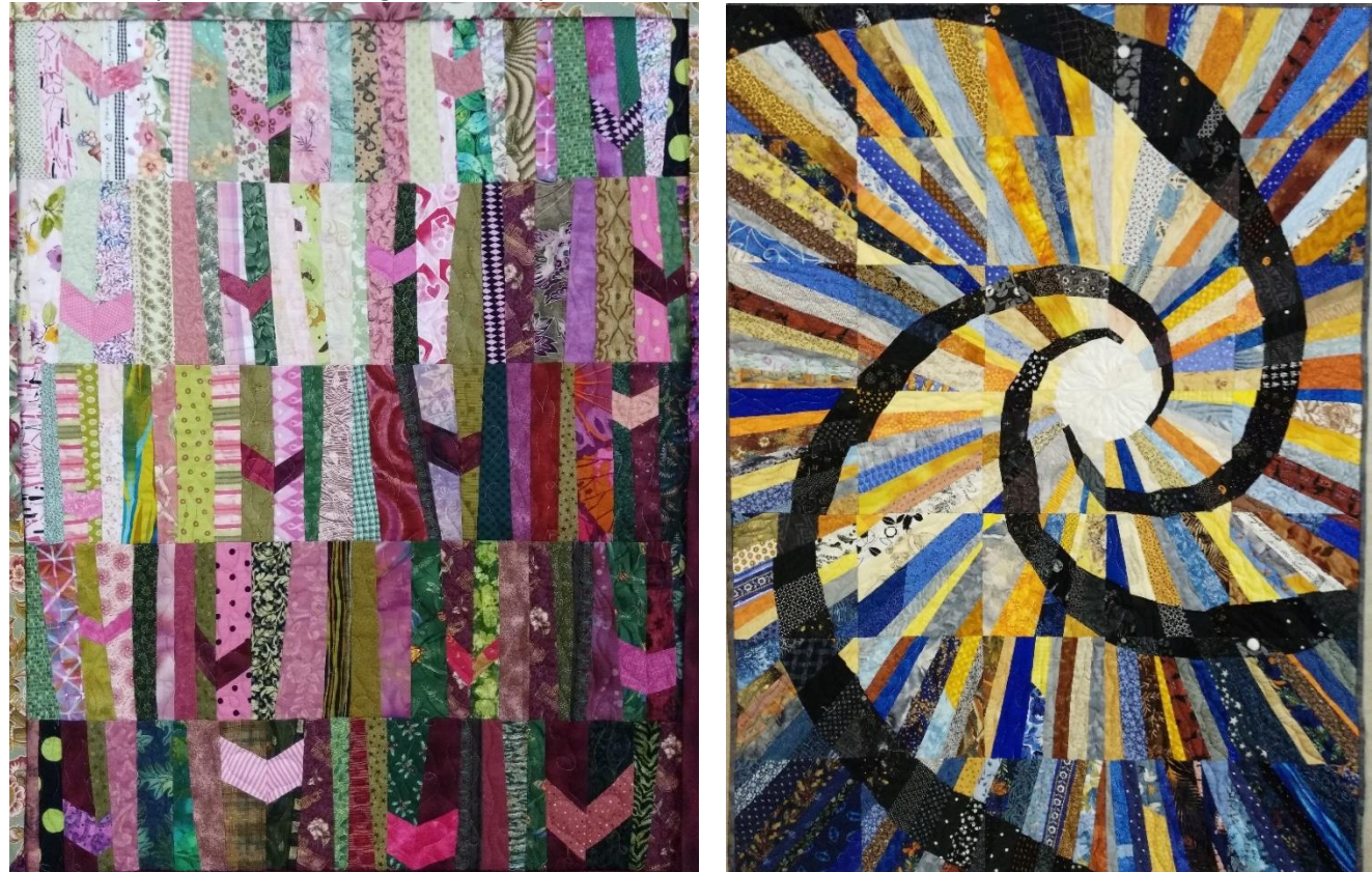
Flutterby by Julia Graves 2020