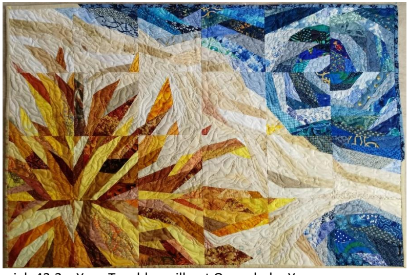
Isaiah 43:2 – Your Troubles will not Overwhelm You by Julia Graves 2020

Genesis 1:3 - Let There Be Light by Julia Graves 2020