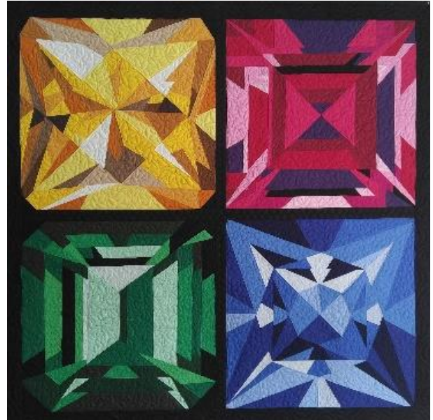
4 gem blocks straight set – 37” x 37”