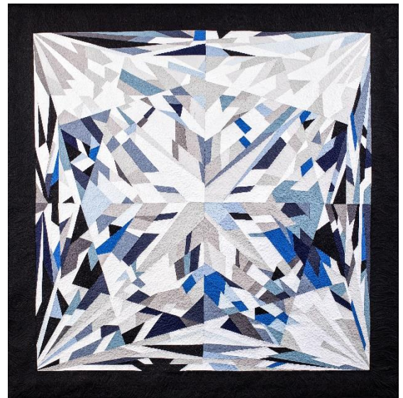
MJ's Newest – Elizabeth 48”x48” Pattern $75, Fabric Kit $110 Available in blue (shown), pink, yellow or neutral