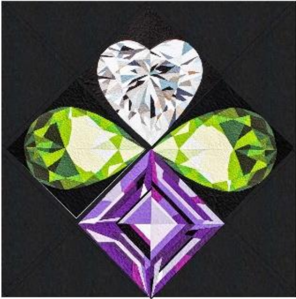
4 gem blocks on point – 51” x 51”

FREE setting patterns for 4 and 12 gems available! Contact Julia at juliagraves82@gmail.com to order free patterns, or to order more gem patterns or fabric bundles.