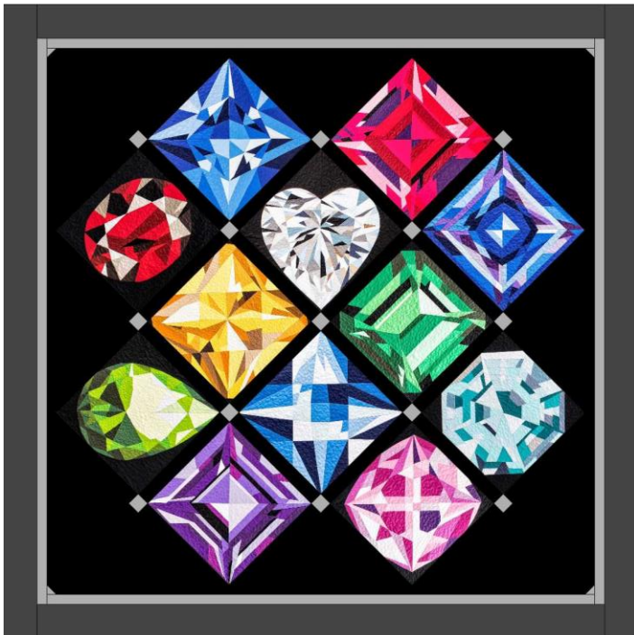
12 gem blocks on point – 93” x 93” (Queen)